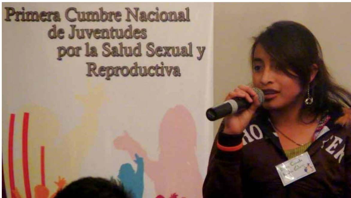
Participants reported out from their groups on critical sexual and reproductive health issues facing young people in Guatemala, including adolescent pregnancy and HIV.

community now has a volunteer group of youth and adolescents to advise staff in Ministry of Health facilities that are supposed to be providing youth-friendly services. Youth participation in these meetings has been facilitated by Guatemalan CSOs that participated in the summit. The ministry has featured these meetings in their public relations materials.