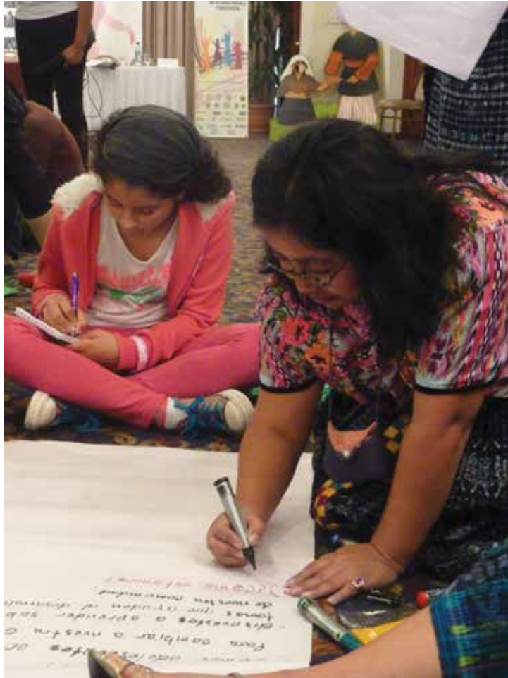
More than 200 young people from 34 Guatemalan organizations across the country participated in the summit.

space without ordering [us what to do], without imposing their opinion.”