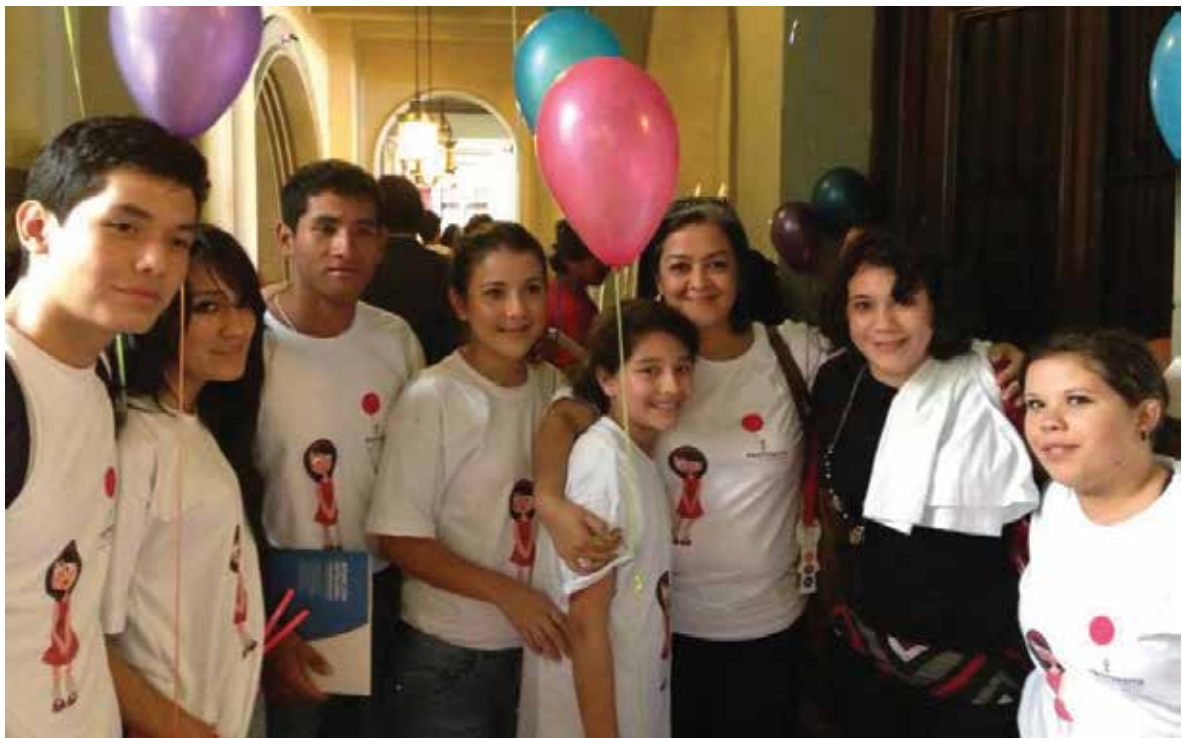
Guatemalan government representatives recognized summit participants like these at the commemoration of the International Day on the Prevention of Adolescent Pregnancy, hosted at the National Palace on September 26, 2013.

The global community must also promote new models of facilitating local advocacy and supporting advocates with the resources and capacity to provide critical feedback on international donor policies and programs. As donors like USAID advance new policies on youth participation and country ownership, youth-led and youth-serving organizations should be important partners—yet they are too often left out of strategy development, implementation, and evaluation efforts. International allies can play an important role to bridge the gaps, particularly between local-level youth-led groups and donor or other high level representatives.