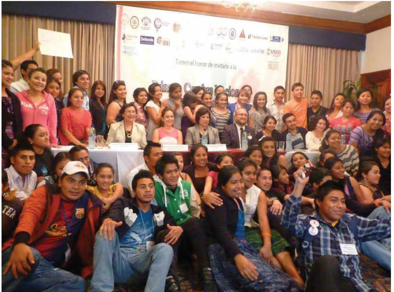
Participants with the closing panel, including representatives from Guatemala's Congress, Ministry of Health, Ministry of Education, and Youth Council.